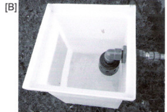
TANK WITH VALVE PROPERLY INSTALLED

The tank comes with a pre-drilled 2-inch hole. The "float valve mechanism" installs through this hole so that the float valve is on the inside, and the garden hose attachment is on the outside.