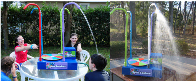
Play without Power Showerhead (unscrew from spout)